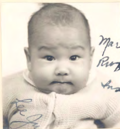
Photo of LEE JUN FON

State of California ) City and County of ) ss San Francisco )